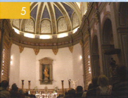
Plaça de l'Església