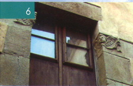
C/ Codolar, 4