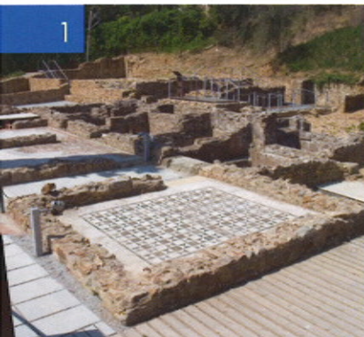
Av. del Pelegrí, 5 - 13

Bone and ivory styluses, ceramics, coins and brooches ( fibulae ) on display in Tossa Municipal Museum bear witness to the daily life of the villa. This type of Roman villa combined farming (Els Ametllers estate covered a large part of present-day Tossa municipal area) with the comfortable, luxurious lifestyle of its proprietors. Most of the structures that can be seen today date from the Augustan period (late 1st c. BC – early 1st c. AD).