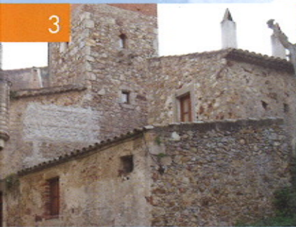
C/ La Guàrdia, 56